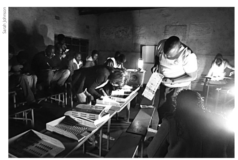
Election workers review ballots late into the night.

women's engagement.<sup>46</sup> Equal rights of men and women, including in public and political life, are guaranteed by the constitution.<sup>47</sup> Despite this fact, representation by women in elected office in Zambia is among the lowest levels in the SADC region.<sup>48</sup> The constitution does not establish a mechanism for promotion or compliance with the gender equality rule, thus failing to meet Zambia's international obligation to give effect to women's rights and gender equality.