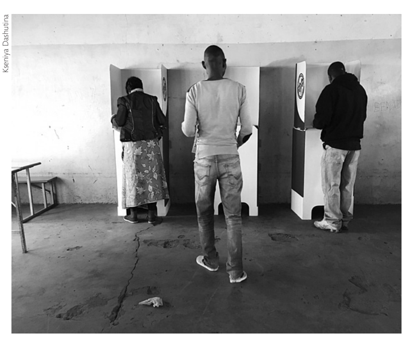
Temporary voting booths provide confidentiality as voters complete their ballots.

secrecy of the ballot and is inconsistent with the voting procedure outlined in Section 60(5) of the 2016 Electoral Process Act.<sup>113</sup>