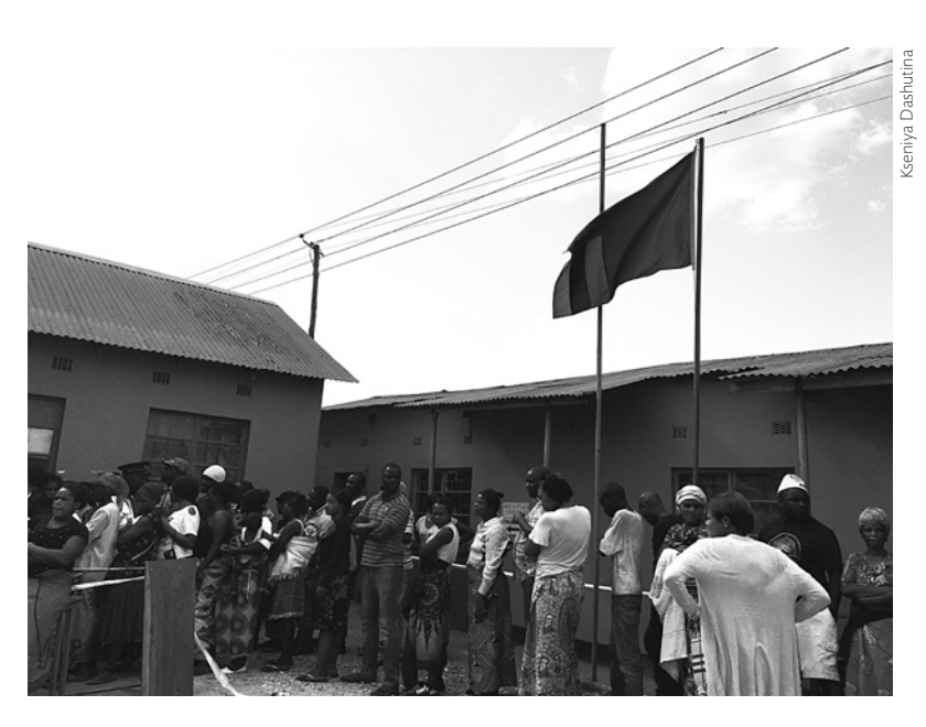
Polling places offered guidance to lines of voters.

pertaining to anti-corruption and electoral best practices, results were not consistently posted at the polling station level. Due to a lengthy counting process, election officials relocated the materials to the totaling centers in some instances, which likely contributed to this failure.