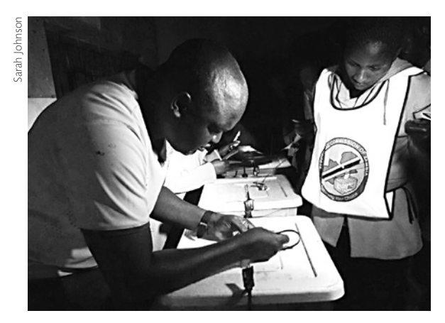
Polling station officers seal the ballot boxes and sensitive materials after finishing the ballot count.

Domestic observer groups should be provided accreditation to observe all phases of the electoral process to ensure transparency and independent