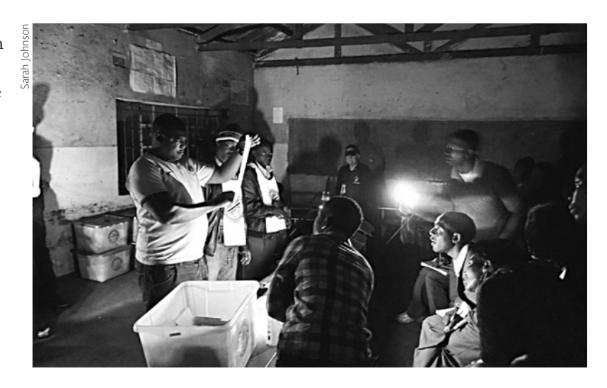
Framework of Elections, p. 28

An observer with The Carter Center watches a polling station's ballot box review.