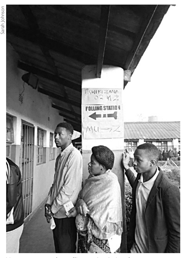
Voters queue at the polling station in Lusaka.

7 UNHRC, General Comment 25, para. 15, states: "The effective implementation of the right and the opportunity to stand for elective office ensures that persons entitled to vote have a free choice of candidates. Any restrictions on the right to stand for election, such as minimum age, must be justifiable on objective and reasonable criteria. Persons who are otherwise eligible to stand for election should not be excluded by